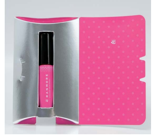
A gentle flocky type for easy application