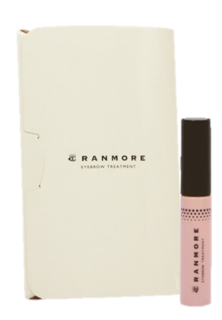
A gentle flocky type for easy application

Use within two months of opening. Let this product dry before applying eyebrow makeup.